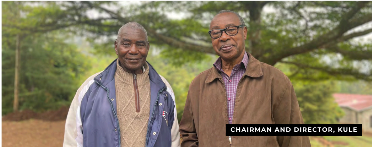
CHAIRMAN AND DIRECTOR, KULE